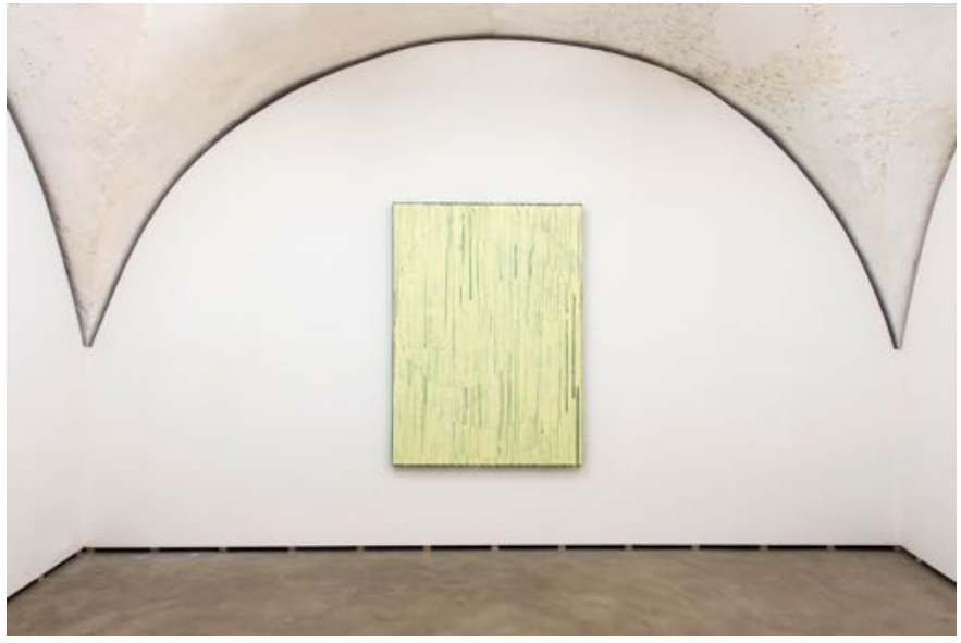
Then, what can painting be?

In addition, most of my structures and figurations are bound to the form of the painting. They are self-referring, so to speak, and maybe this reminds of the idea of functionalism? But actually, I cannot speak of a main influence. The Bauhaus has impressed me as much as some painters a hundred of years earlier. At the moment, for example, I am very interested in icons, a much older genre. Above all the main question for me is: what can painting be?